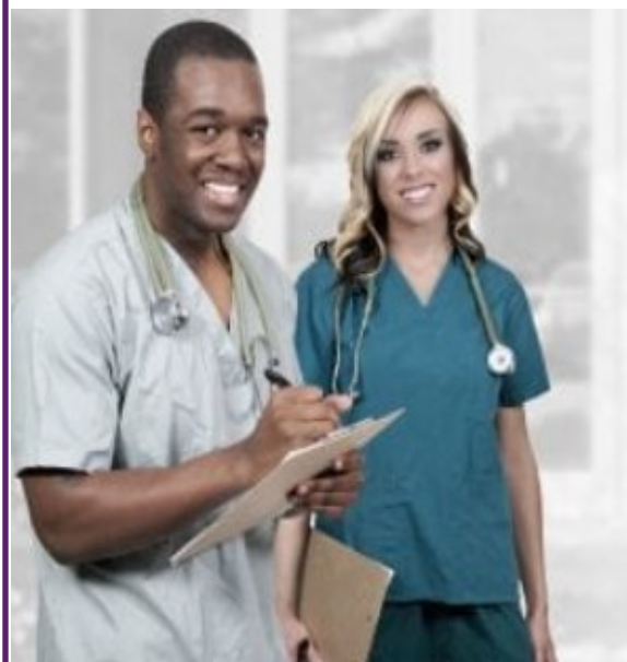
CCMA training requires an 80 to 150-hour externship to be completed after class completion and certification.