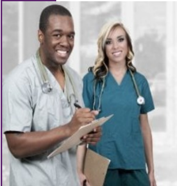
CCMA training requires an 80 to 150-hour externship to be completed after class completion and certification.