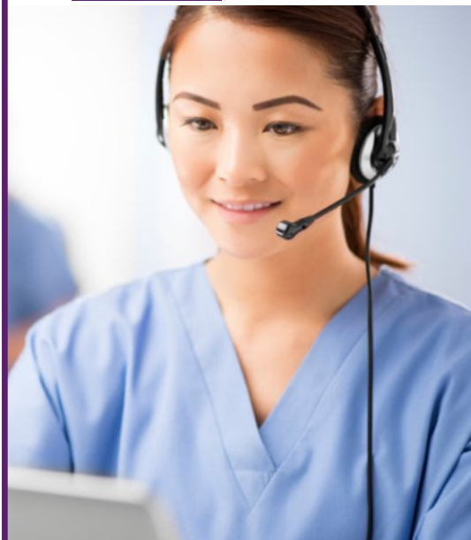
Students will complete a mandatory 24-hour clinical experience during the class.