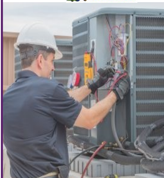
Mandatory Field Experiences will take place during Fall Break.