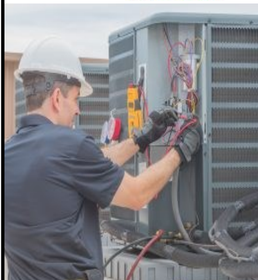
Mandatory Field Experiences will take place beginning Week 11.